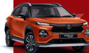
Orange/black bi-tone (E88)