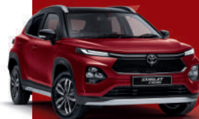
Red/black bi-tone (E86)