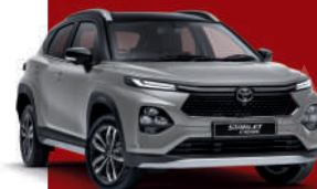
Silver/black bi-tone (E85)