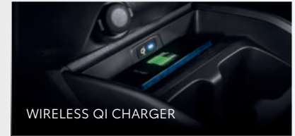
WIRELESS QI CHARGER

Another notable features, reserved mainly for premium segment cars, are the 360° view camera and Head-Up Display, designed to keep you safely in control on your journeys.